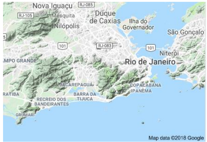
Figure 2: A relief map showing Rio and surrounding areas.

(a) Study Figures 1. and 2 which shows the roads pattern and the relief of Rio de Janeiro and the surrounding areas.